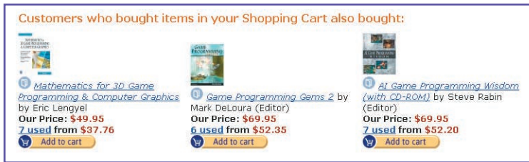
Figure 2. Amazon.com shopping cart recommendations. The recommendations are based on the items in the customer’s cart: The Pragmatic Programmer and Physics for Game Developers.

customer base. The complex and expensive clustering computation is run offline. However, recommendation quality is low. 1 Cluster models group numerous customers together in a segment, match a user to a segment, and then consider all customers in the segment similar customers for the purpose of making recommendations. Because the similar customers that the cluster models find are not the most similar customers, the recommendations they produce are less relevant. It is possible to improve quality by using numerous fine-grained segments, but then online user-segment classification becomes almost as expensive as finding similar customers using collaborative filtering.